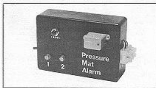
Outside view of the finished unit. The terminal block for the pressure mat connections is shown on the right.

I was starting to use those vibrating reed d.c. buzzers and I dressed up the two panel-mounting l.e.d.s with lens-clips, which were also quite new (Maplin again). White rub-down lettering completed the presentation.